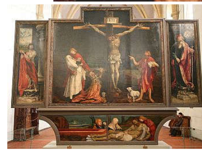
Matthias Grünewald (1480-1528) detail of the Isenheim Altarpiece - Johannes der Täufer